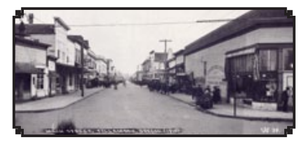
Downtown Tillamook, circa 1910

Want to know more? Write to: PO Box 123, Tillamook, Oregon 97141 http://www.tcpm.org/tchs.htm