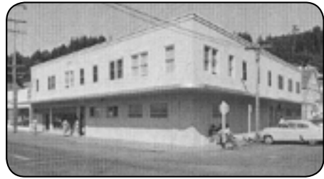
Rinehart Clinic 1950