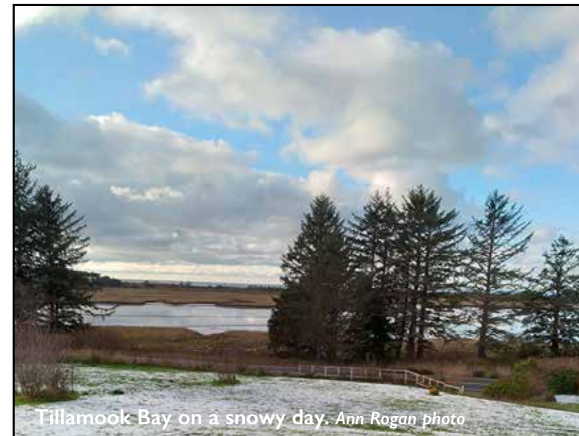
Tillamook Bay on a snowy day.

The organization was first formed in 1977 and went on to become a registered non-profit in 1984. Since then, the TCHS has built a legacy of projects and publications that form a cornerstone of our local historical record. Sometimes confused with the Tillamook County Pioneer Association--made up of "pioneers" whose families were born in or have lived in Tillamook County for at least 40 years--the TCHS is open to everyone.