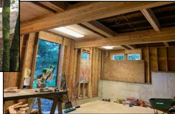
The basement ceiling, showing the structural improvements made to create the science lab, BCAC photo.

School District, joined the project early on to plan and oversee construction of the science lab.