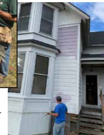
The final color goes on the building on Halloween, 2021. A long time coming!